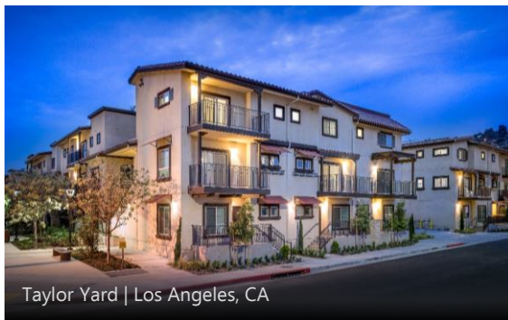
Taylor Yard | Los Angeles, CA